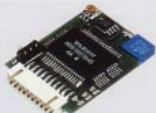
Voice Synthesizer Unit FVS-1A