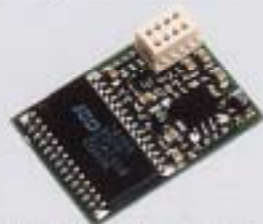
Digital Voice Recorder DVS-4