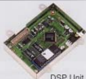
DSP Unit DSP-1